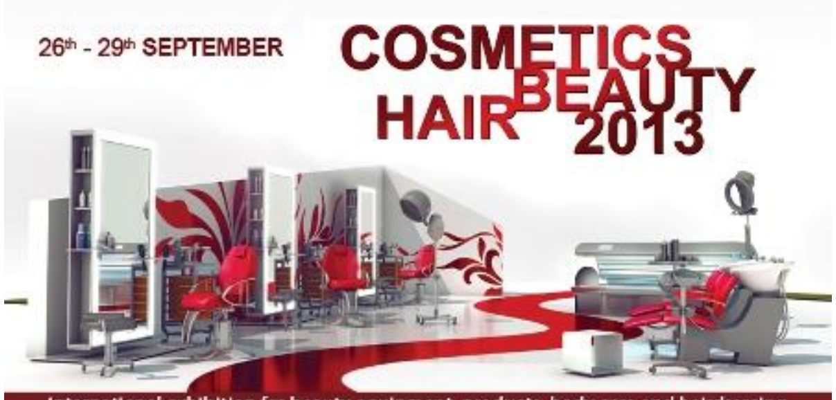
International exhibition for beauty equipment, products, body care and hairdressing

COSMETICS BEAUTY HAIR 2013 - International exhibition for beauty equipment, products, body care and hairdressing